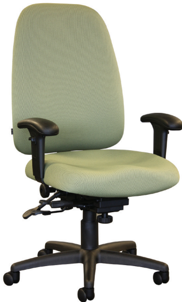
480-03 shown with optional AT armrests.