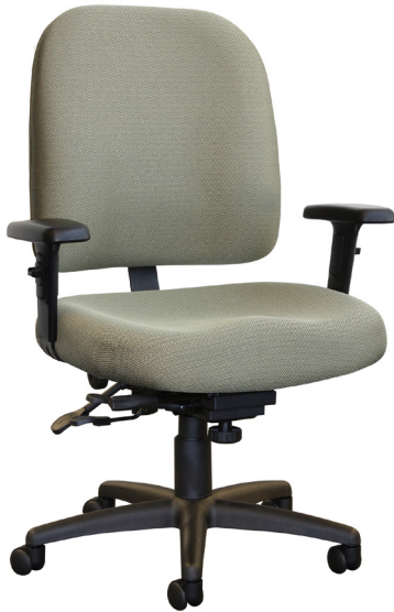
420-03 shown with optional AT armrests.