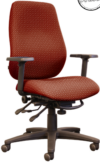
660-01HDSS Shown with optional WAAT armrests