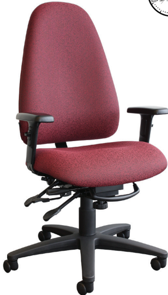
270-01HDSS shown with optional WAAT armrests