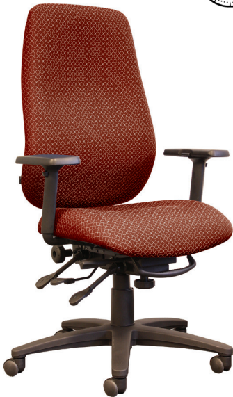
670-01HDSS Shown with optional WAAT armrests