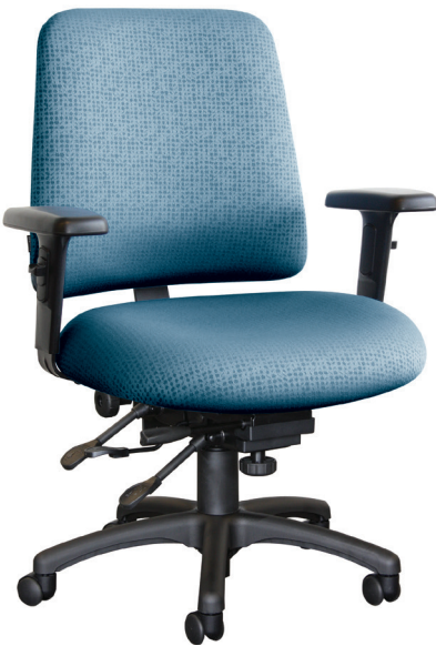
202-03 shown with optional AAT armrests.