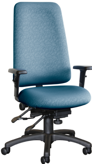
223-03 shown with optional AAT armrests.