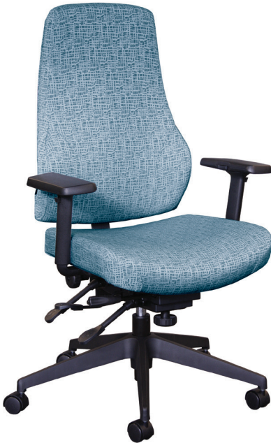
570-03 shown with optional TAT armrests.