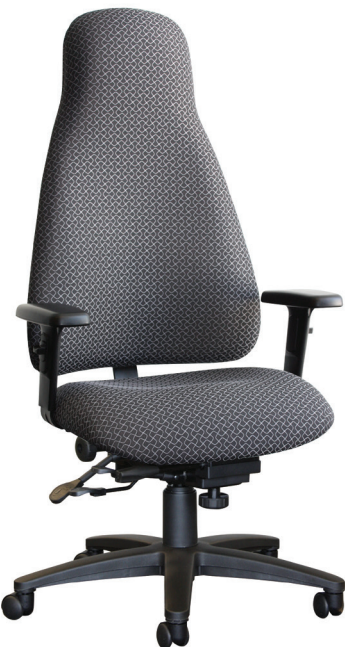
280-03 shown with optional AAT armrests.