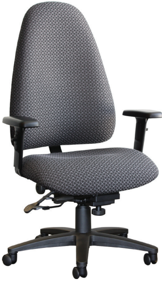
270-03 shown with optional AAT armrests.