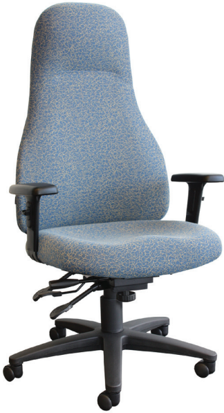
284-03 shown with optional AAT armrests.