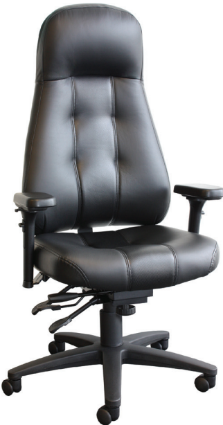
285-03 shown with optional LAT armrests.