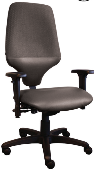
684-14HD Shown with optional SA armrests