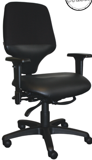
680-01HDSS Shown with optional SA armrests